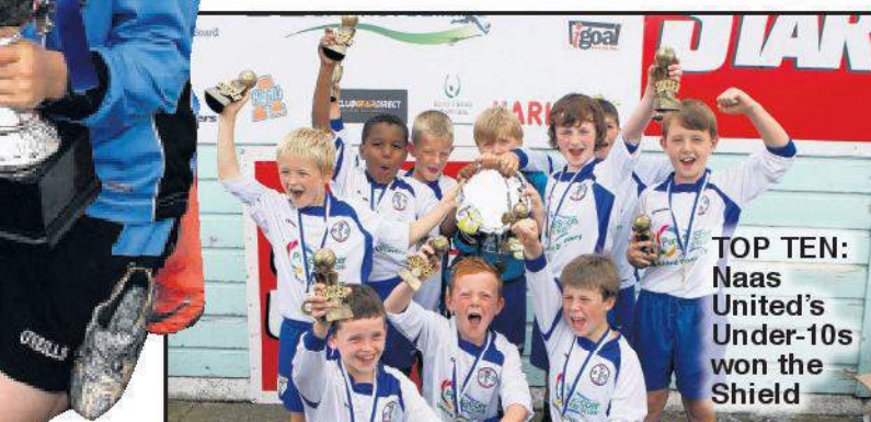
TOP TEN: Naas United's Under-10s won the Shield