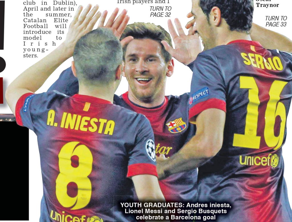
YOUTH GRADUATES: Andres iniesta, Lionel Messi and Sergio Busquets celebrate a Barcelona goal