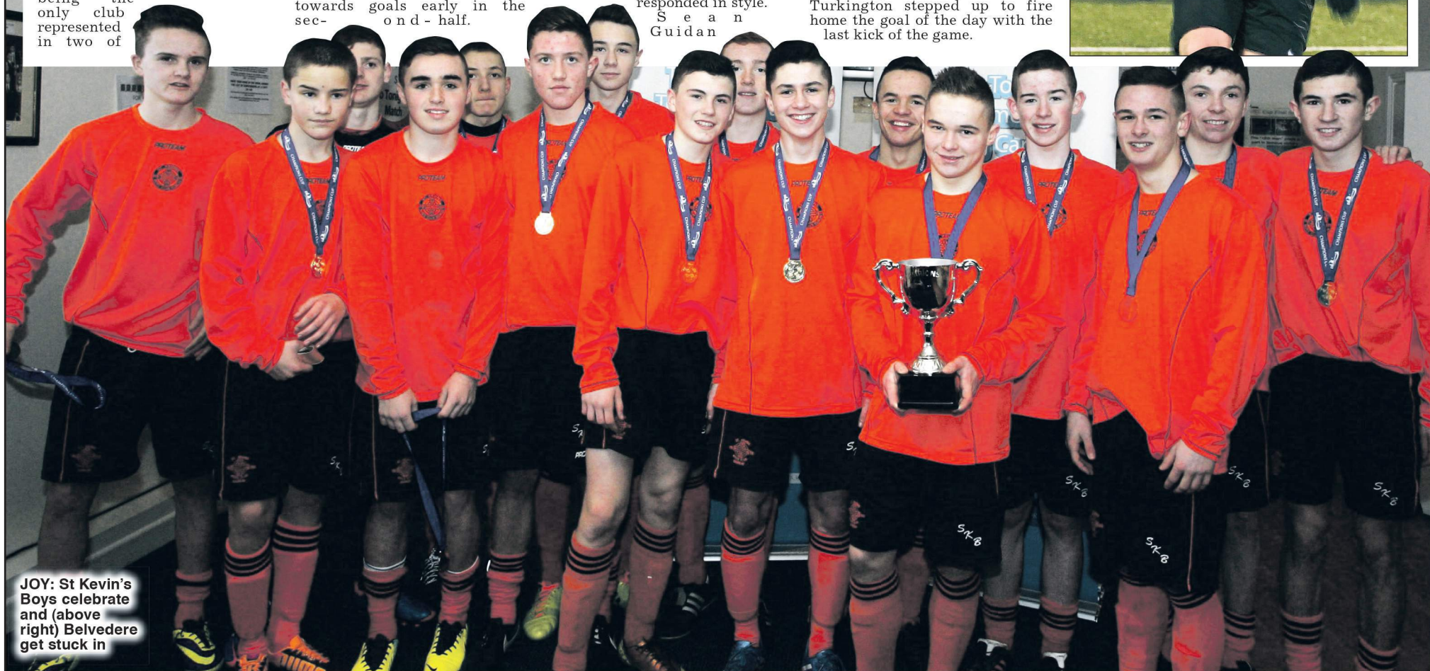
JOY: St Kevin's Boys celebrate and (above right) Belvedere get stuck in