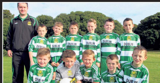
SHARING THE SPOILS: Raheny (below) and Sheriff (above) finished as a 2-2 draw