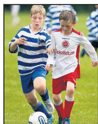
ROCK SOLID: Home Farm Under-11s versus Rock Celtic and (left) Belvedere celebrate