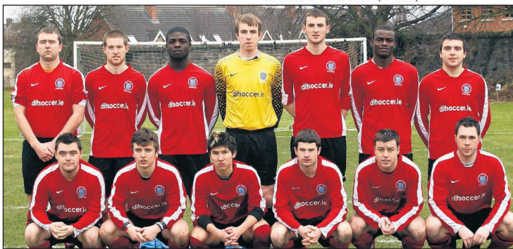
RED-DY FOR BATTLE: DIT line out ahead of the game