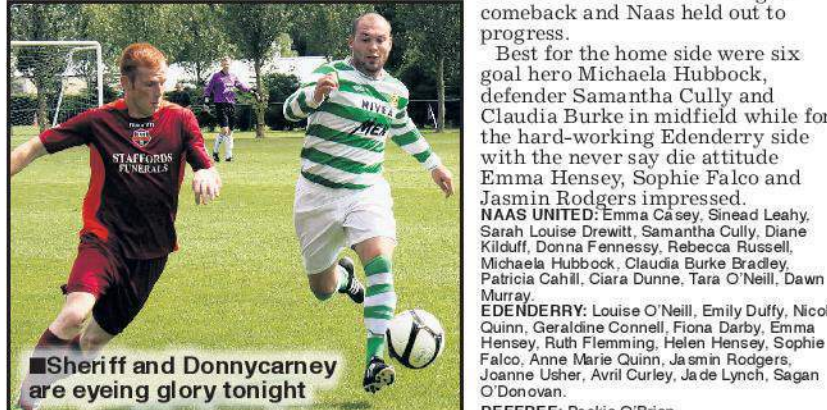
■ Sheriff and Donnycarney are eyeing glory tonight

SEMI-FINALS: Winners of 1 v winners of 2 and winners of 3 v winners of 4.